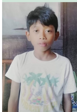
^ BEFORE >