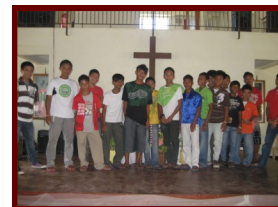
Taclobo I Boys Dorm

The Conselo-Taclobo I Dorm is underfunded!