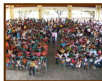
The Sunday morning worship service

The Lord continues to work in an amazing way.