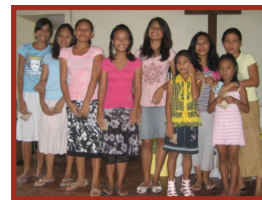
The Wee Women Dorm Girls

A 9 year old tells of her life in Manila where she took care of her little sister when she was only seven. Her mother left her father and brought them to Negros Oriental where she farmed and sold her harvest from house to house. Living in the house of her Auntie, she cried when she witnessed her uncle abusing her younger sister; but felt helpless because her uncle threatened her if she told her mother. Her Auntie invited her mother to work in her home as a laundry woman. This was when she was referred to LCP and accepted. She is thankful to God for preparing such a nice place for her to live. Next year she will be in the third grade.