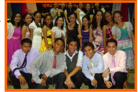
LCP March 2011 Graduates

The students now have hope for tomorrow and will impact the world wherever they go on life's journey thanks to generous sponsors and donors who made this day of celebration possible.