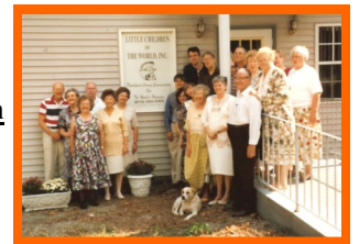
Early Years LCW Board & Advisory Council

In closing, a quote from the Georgia Resolution says it all: "WHEREAS, he gave inspiration to many through his high ideals, morals, and deep concern for his fellow citizens, and the devotion, patience, and understanding he demonstrated to his family and friends were admired by others, WHEREAS, he was a person of magnanimous strengths with an unimpeachable reputation for integrity, intelligence, fairness and kindness, and by example he made this world a better place in which to live." So he did!